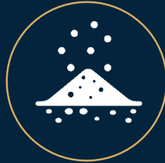
Iron Ore Concentrates